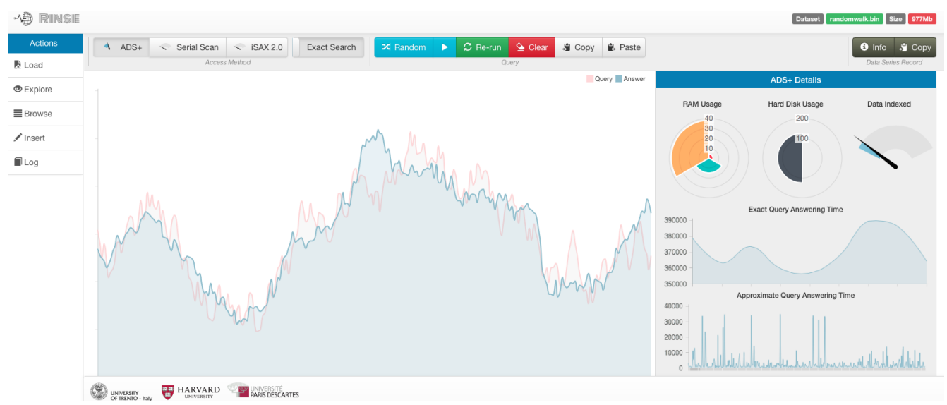
Figure 5: RINSE in action

representation. Then, the index tree is traversed searching for a leaf with an iSAX representation similar to that of the query. In the case that the leaf node where the search ends is in PARTIAL mode (as seen in Figure 2), i.e., it contains only iSAX representations but not any data series, then all missing data series are fetched from the raw file. At this point the leaf data is fully materialized and future queries that need to access the data series can find them in this leaf. The real distance from the query using the raw data is calculated. The minimum distance found in the leaf can be used as an approximate answer. If we need an exact answer, the process is repeated for the next most promising node until we can't improve our answer any more. To prune the search space, we use the minimum distance bounding function of iSAX, described in [15].